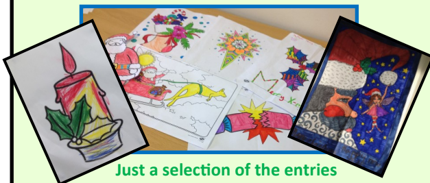
Just a selection of the entries